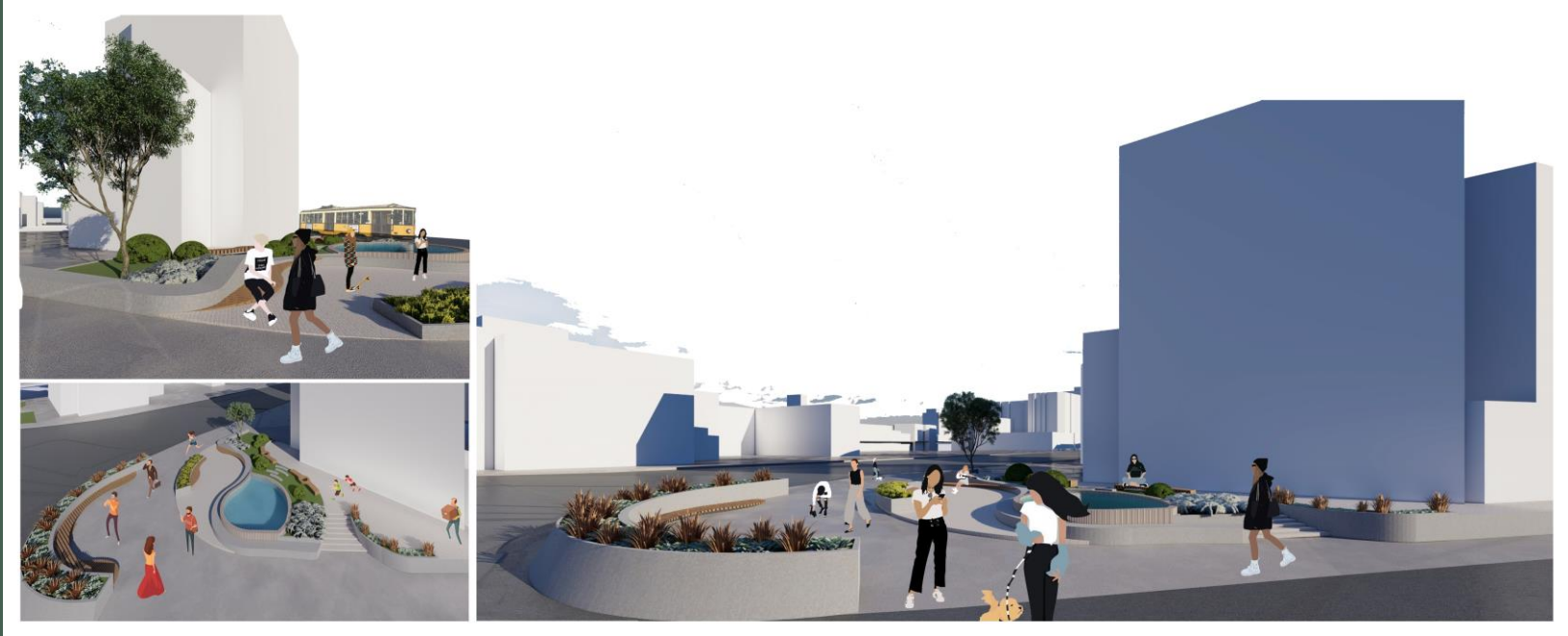
Landscape proposal in Iasi: crossroad between Independence Blvd. with Alexandru Lapusneanu street