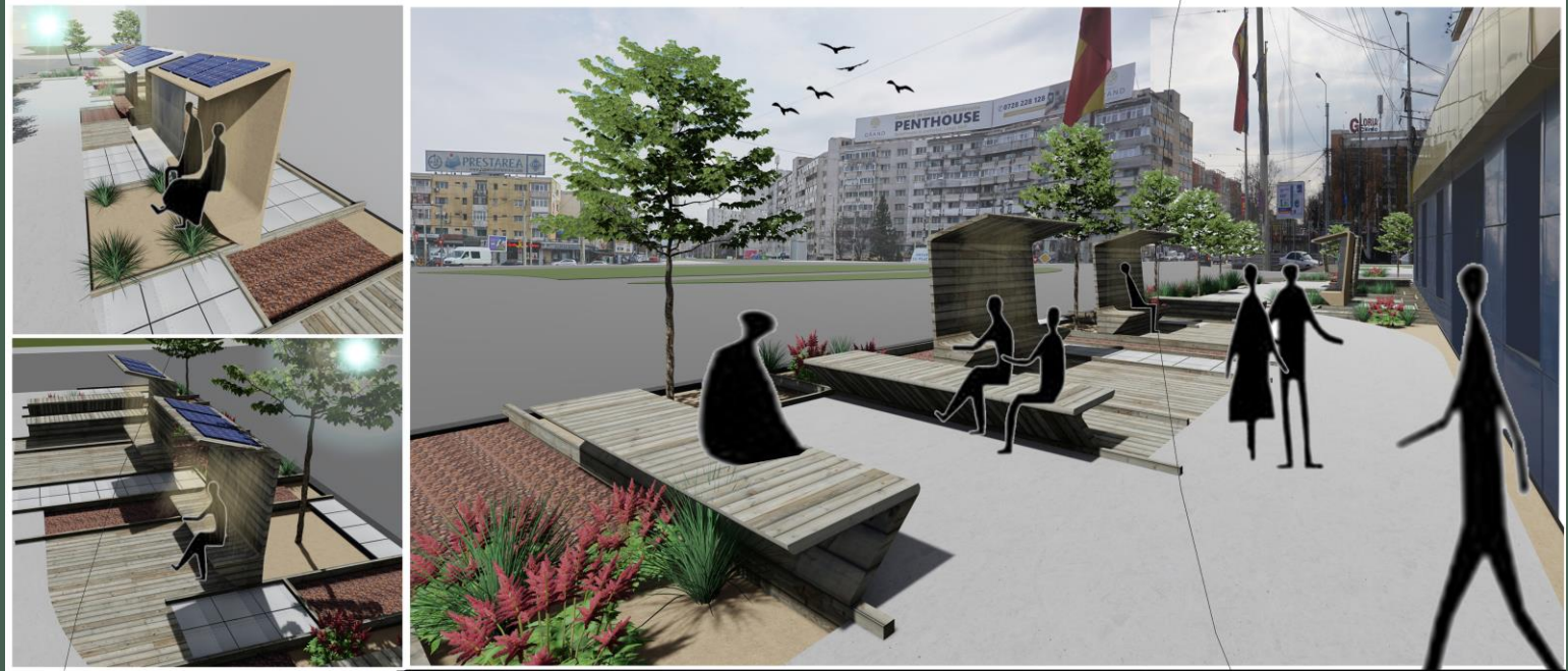
Landscape proposal in Iasi: crossroad between Independence Blvd. with Alexandru Lapusneanu street